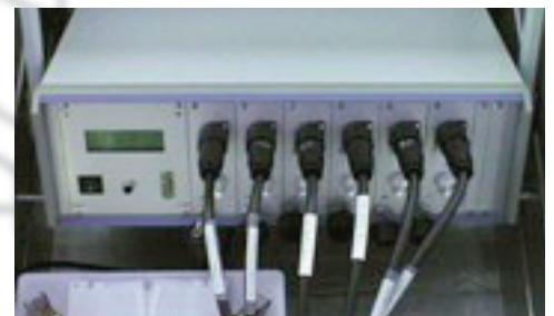
LLF-M with 6 signal channels