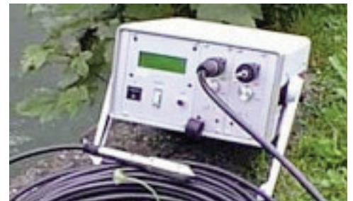
LLF-M with 2 signal channels